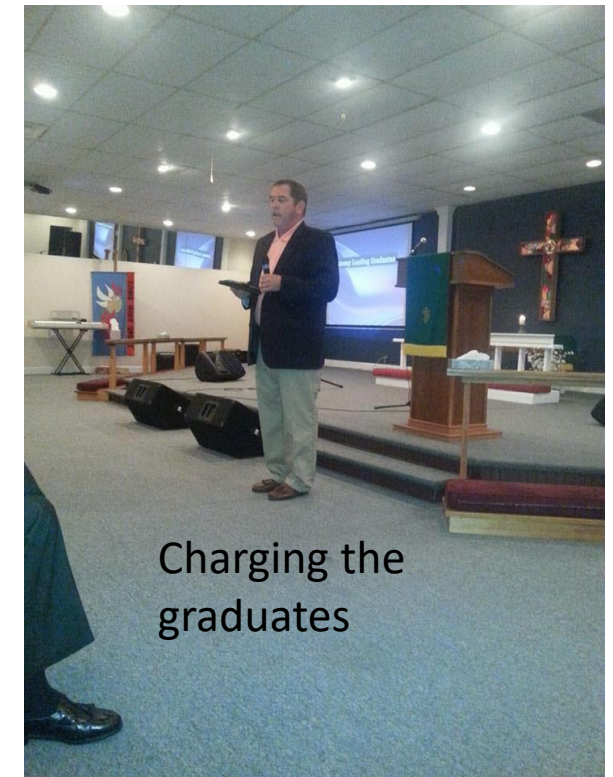
Charging the graduates